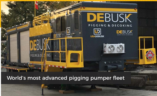
World's most advanced pigging pumper fleet