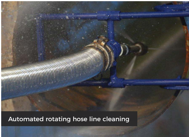
Automated rotating hose line cleaning